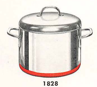
Capacity 8 quarts