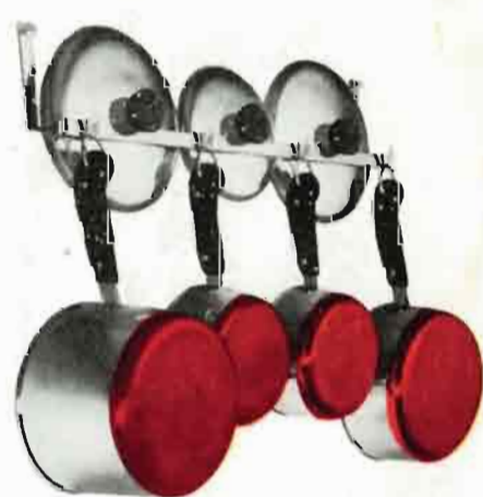
1721 REVERE UTENSIL RACK