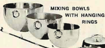
MIXING BOWLS WITH HANGING RINGS