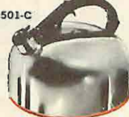
SOLID COPPER BOTTOM STAINLESS STEEL TEAKETTLES