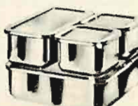
COVERED HANDY PANS