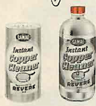
16 Oz. Powder