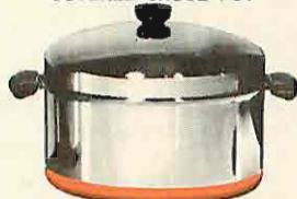
COVERED DUTCH OVEN