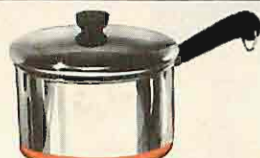
COVERED SAUCE PAN