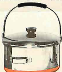
BAIL HANDLE KETTLE