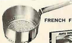
FRENCH FRYER BASKET