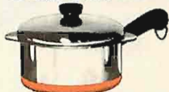
COVERED DOUBLE BOILER