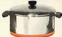
COVERED SAUCE POT